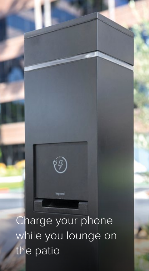
Charge your phone while you lounge on the patio