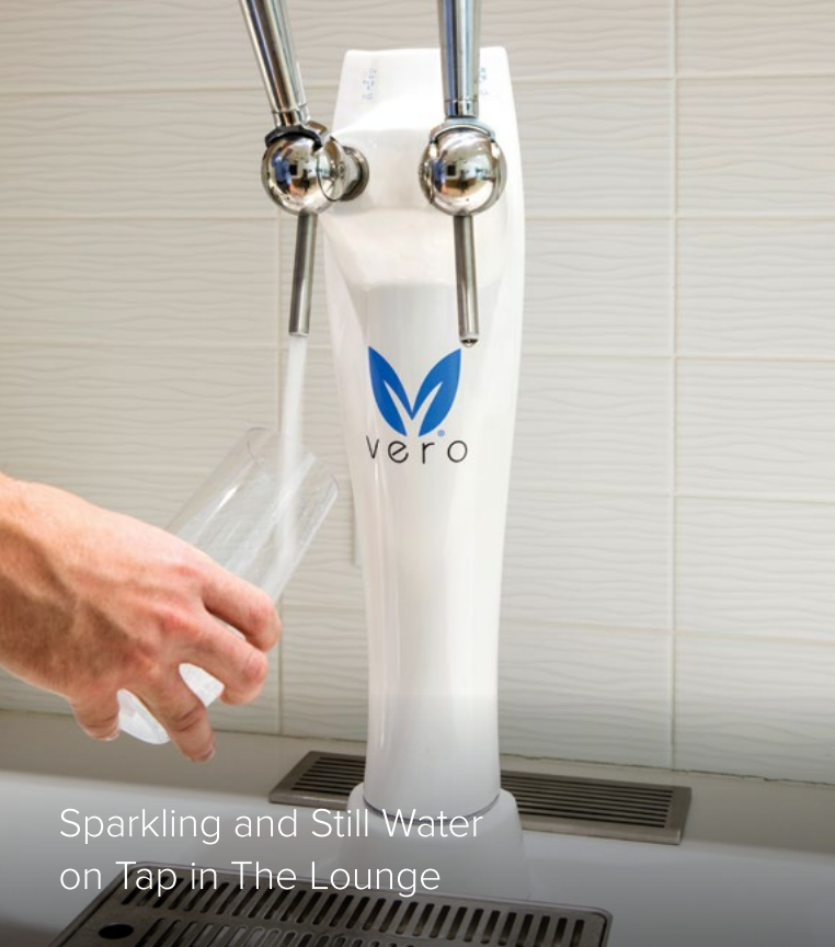
Sparkling and Still Water on Tap in The Lounge