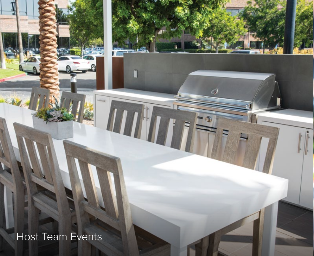
Host Team Events