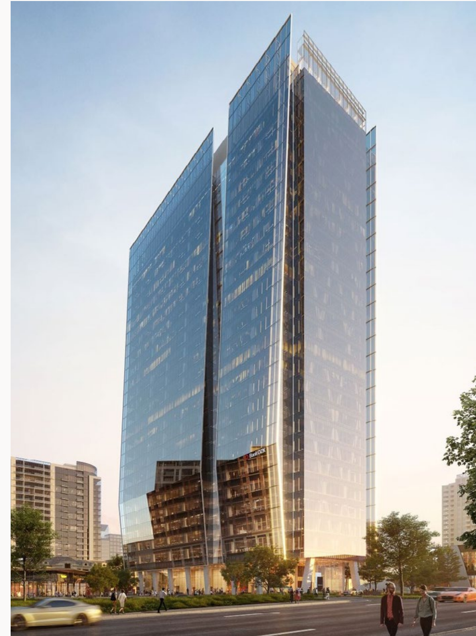
23Springs Dallas, TX

422,109 RSF Part of Granite Park – Our 90-Acre, 2 million SF Office Park