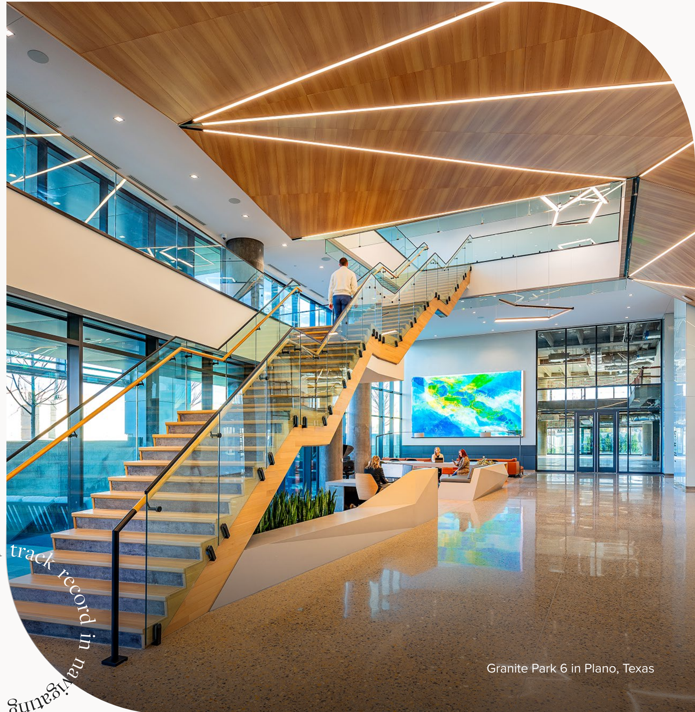
Granite Park 6 in Plano, Texas

Proven track record in navigating complex markets.