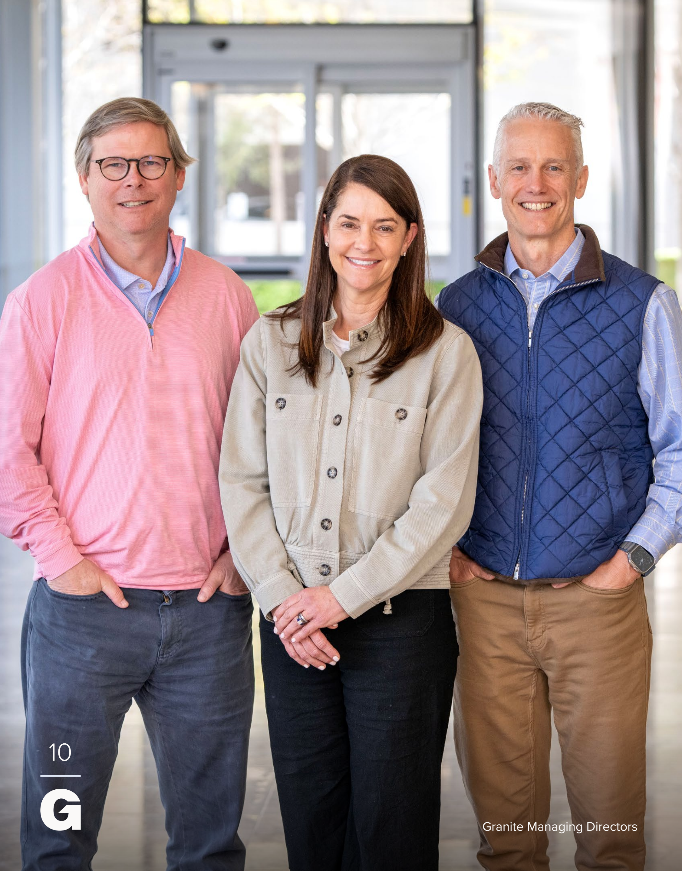
Granite Managing Directors