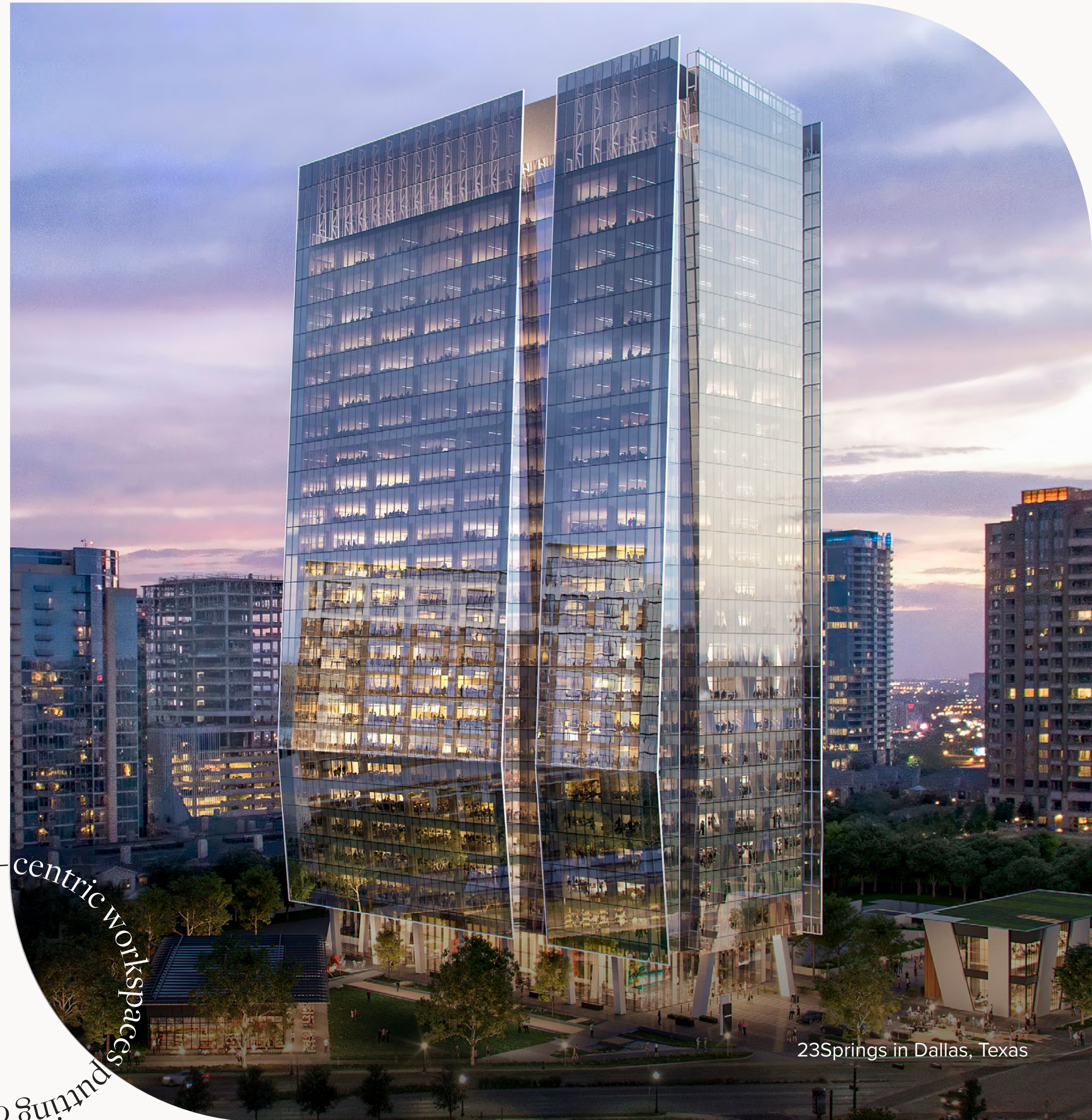
23Springs in Dallas, Texas

Putting our customers first. People-centric workspaces.