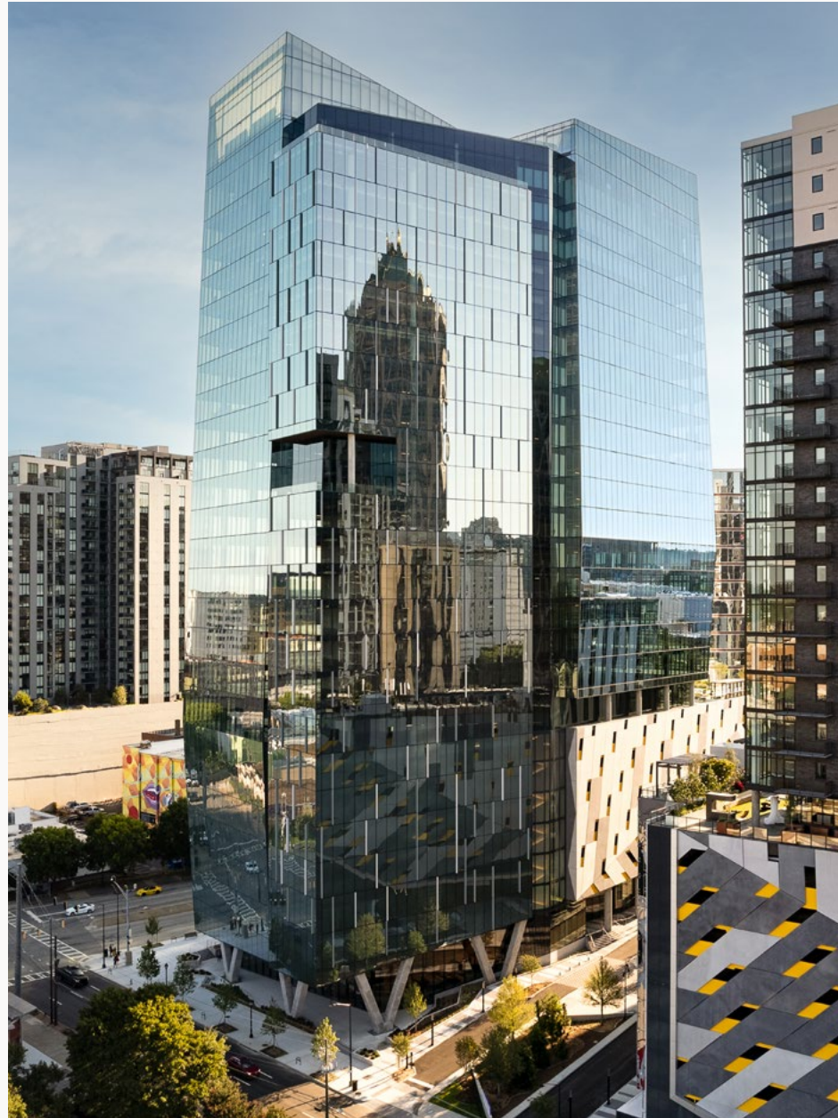
Midtown Union Atlanta, GA

612,947 RSF 18,902 SF Restaurants 230-Key Kimpton Hotel 355-Unit Residential Tower