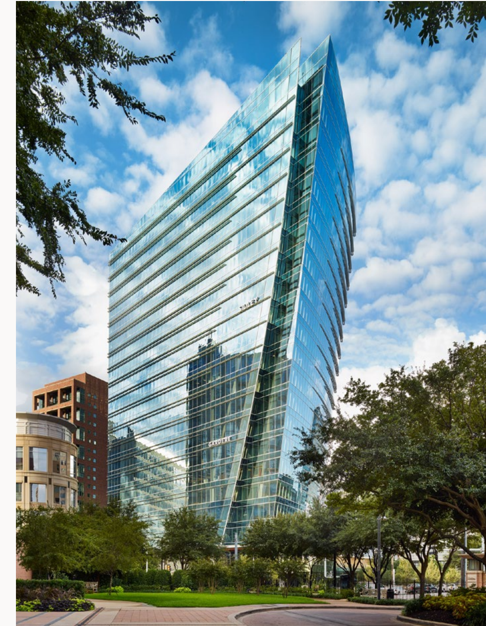
McKinney & Olive Dallas, TX

642,670 RSF 16,455 SF Upscale Restaurants Largest Office Building In Uptown Dallas