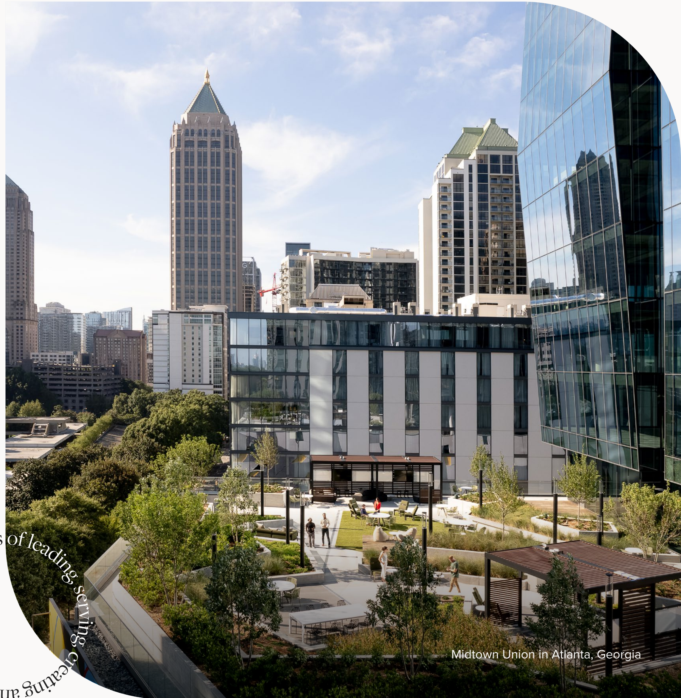
Midtown Union in Atlanta, Georgia

Three decades of leading, serving, creating and improving.